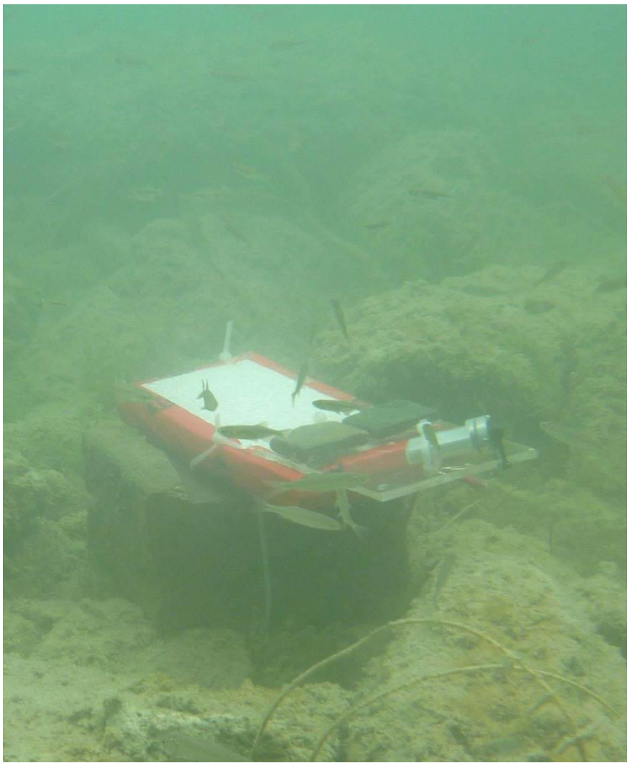
Figure 3: Example of Periphyton sampler